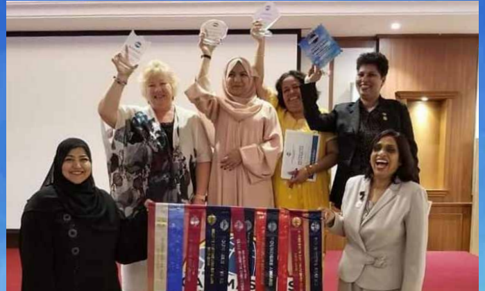
DOMINA TOASTMASTERS CLUB