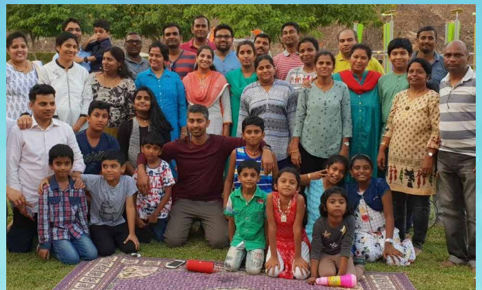
MANA TKS TOASTMASTERS CLUB