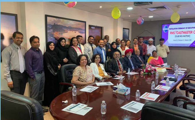
RMS TOASTMASTERS CLUB