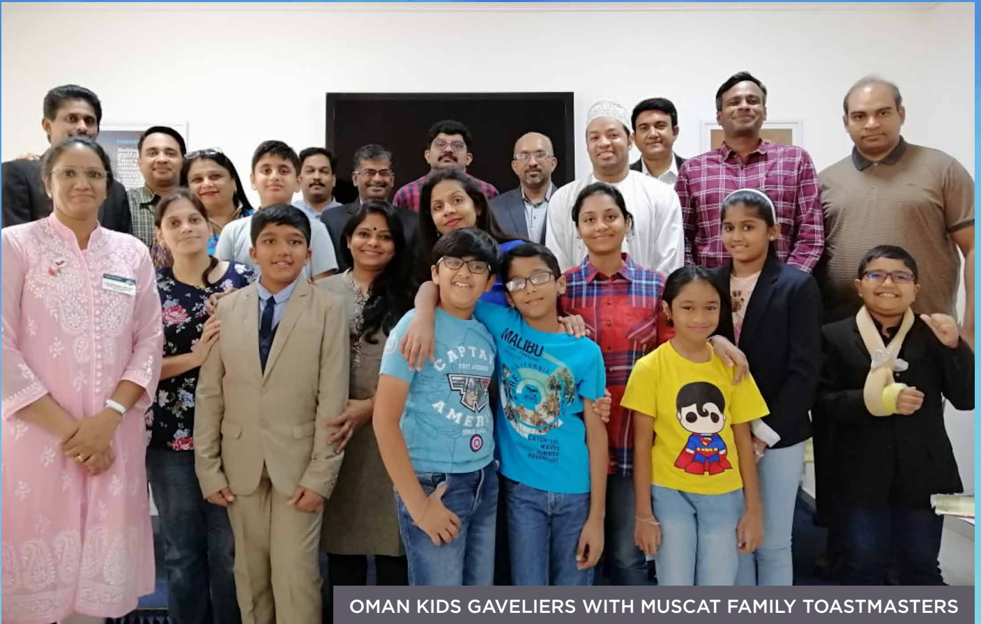
OMAN KIDS GAVELIERS WITH MUSCAT FAMILY TOASTMASTERS

Division C was born in the year 2017-18, when District 20 was reorganized and divided into two districts, District 20 and District 105. Though still an infant, Division C has a healthy membership of over 320 members in its 15 clubs spread across three Areas (10, 11 & 12). The division has a mix