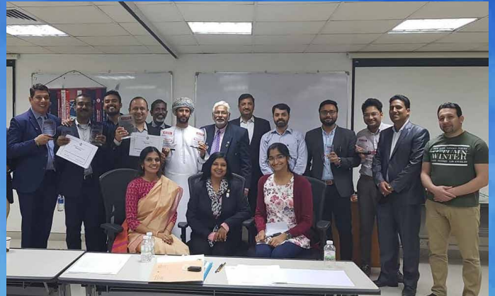
ELITE TOASTMASTERS CLUB