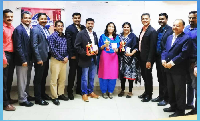
RUWI MALAYALAM TOASTMASTERS CLUB