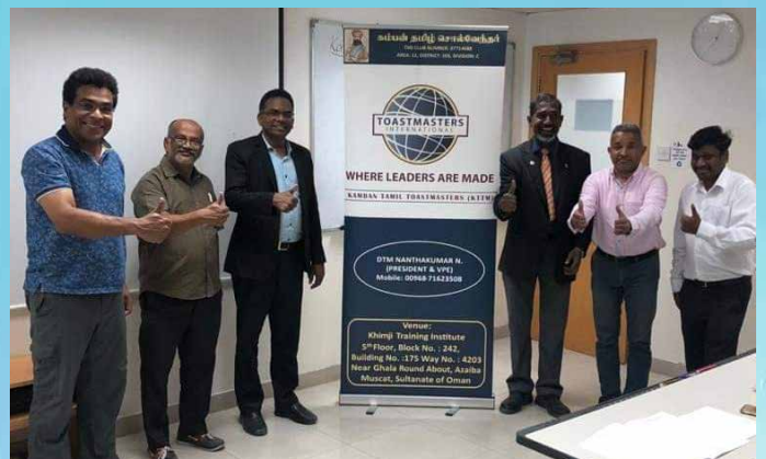
KAMBAN TAMIL TOASTMASTERS CLUB