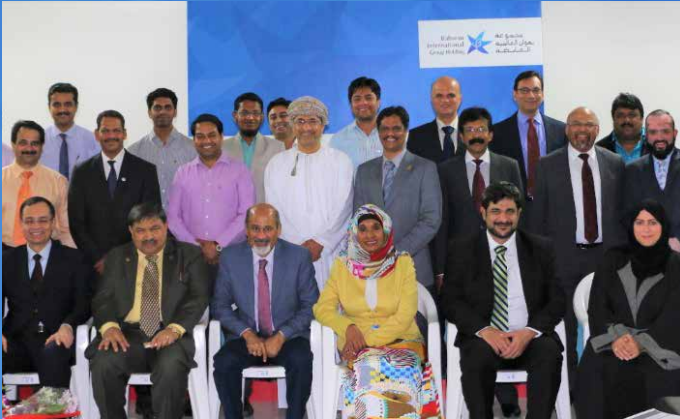
BAHWAN INTERNATIONAL GROUP TOASTMASTERS CLUB