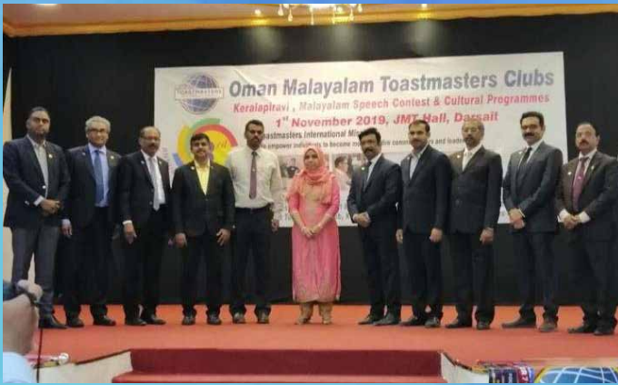
MALAYALAM TOASTMASTERS CLUB