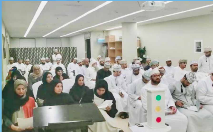
MUSCAT DEBATERS TOASTMASTERS CLUB