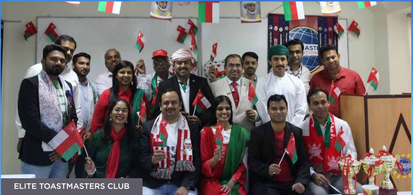
ELITE TOASTMASTERS CLUB

“When the world relaxes, we sharpen our axes”. This has been and is the mantra of Elite Toastmasters Club, the club that was chosen as the “Best Club for members in Oman” by the District for the year 2019-20. True to the tag line, our club has grown by leaps and bounds over the years and this eventually led to us winning the coveted award.