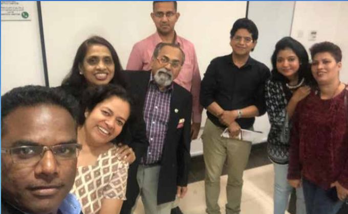
DISTINGUISHED SPEAKERS TOASTMASTERS CLUB