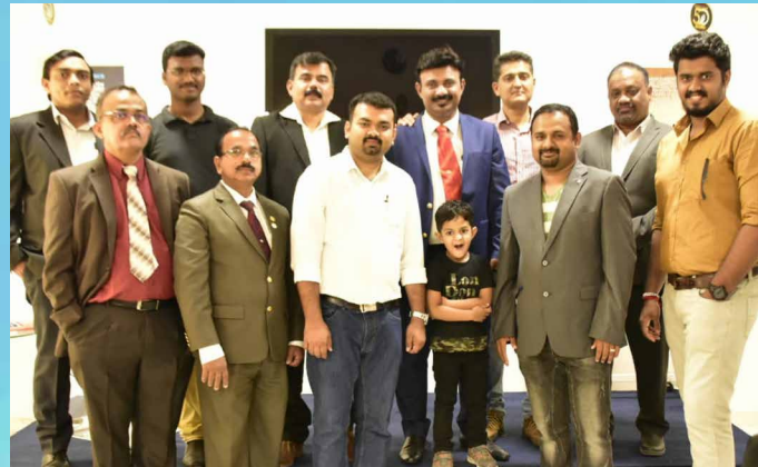
AL KHALILI SUNRISE TOASTMASTERS CLUB