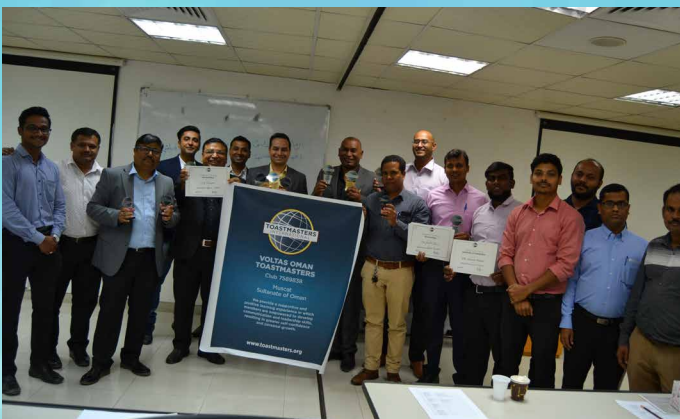
VOLTAS OMAN TOASTMASTERS CLUB