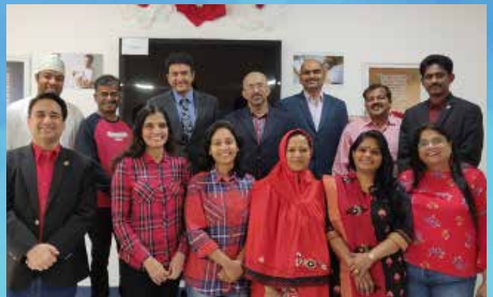
MUSCAT FAMILY TOASTMASTERS CLUB