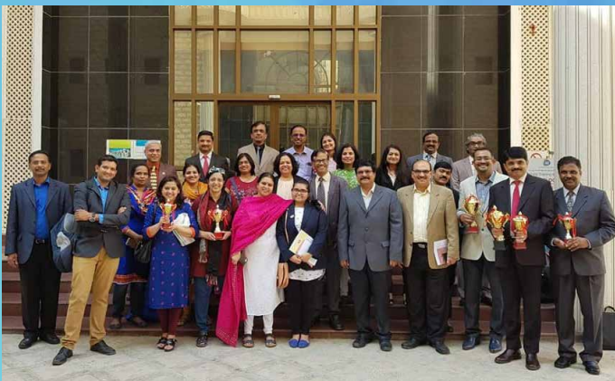
CHANDANA TOASTMASTERS CLUB